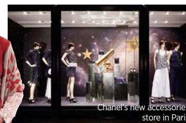
Chanel's new accessories store in Paris

DUBAI-PARIS News that Chanel's boutique at 42 Avenue Montaigne has reopened will see the fashion pack flock to Paris this month to pick up new-season accessories, bags, shoes and costume jewellery. Credit cards beware. +33 (+33) 14 070 8200