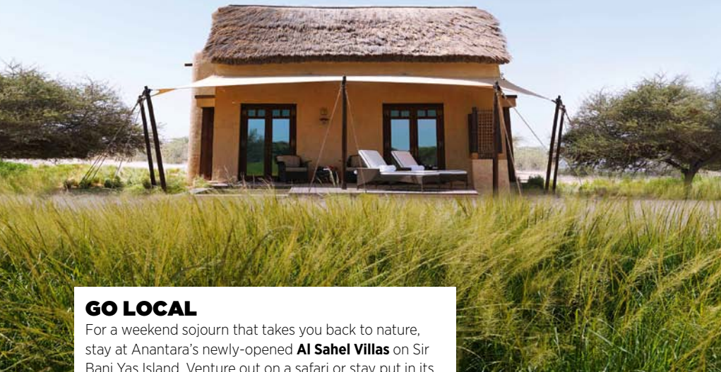
Wild times at Anantara's Al Sahel Villas