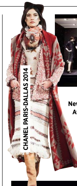
CHANEL PARIS-DALLAS 2014