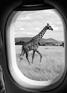
Wildlife and wild rides at Abercrombie & Kent

Want a tailor-made holiday to some of the most exclusive destinations on this planet? Enter travel geniuses Abercrombie & Kent and its first UAE boutique in Etihad Towers, Abu Dhabi, offering bespoke itineraries created by the 'Travel Curators', iPads for visual inspiration, discreet VIP suites and private home visits for Dubai-based customers. Abercrombiekent.com