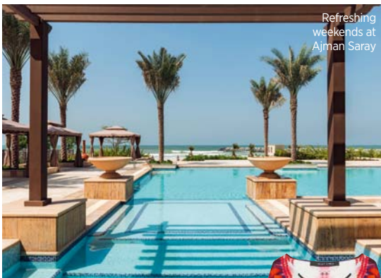
Refreshing weekends at Ajman Saray

For a weekend sojourn that takes you back to nature, stay at Anantara's newly-opened Al Sahel Villas on Sir Bani Yas Island. Venture out on a safari or stay put in its one-of-a-kind thatched pool villas, and let the wildlife come to you. From Dhs2,200 a night, Al-sahel.anantara.com ; Bed down at Ajman's very first Starwoods property, the beachside Ajman Saray , which opens Feb 1. The palatial penthouse Royal Suite, with its private spa treatment room, is fit for an Arabian princesses, while the seafood at Safi restaurant is set to become a Bazaar essential. From Dhs600 a night, Ajmansaray.com