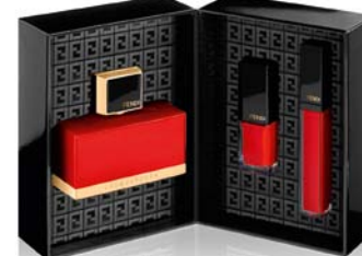
L'Acquarossa Red Essentials, Dhs565 (for the set), Fendi

BEAUTY BUZZ Fendi's new red hot Red Essentials box set has won a place in our vay-cay beauty bags. The L'Acquarossa perfume, scented lip gloss and nail polish will ramp up the romance wherever your Valentine's date takes you - home or away.