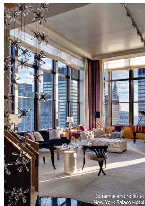
Romance and rocks at New York Palace Hotel