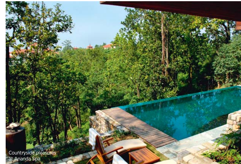
Countryside pleasures at Ananda Spa