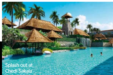
Splash out at Chedi Sakala