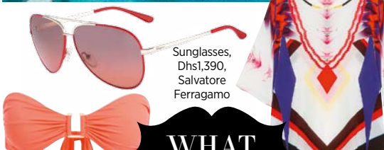
Sunglasses, Dhs1,390, Salvatore Ferragamo