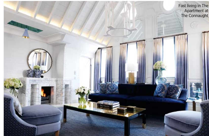
Fast living in The Apartment at The Connaught

Let Taschen's The New York Times - 36 Hours: Asia & Oceania help plot your next big trip, with suggested itineraries in over 60 beautiful destinations, from seeing the skyscrapers of Hong Kong and the beaches of Phuket to surfing in Sydney and eating sushi in Japan. Dhs130, available at Book World By Kinokuniya, Dubai, Art Space Gallery, Dubai and Athr Gallery, Jeddah