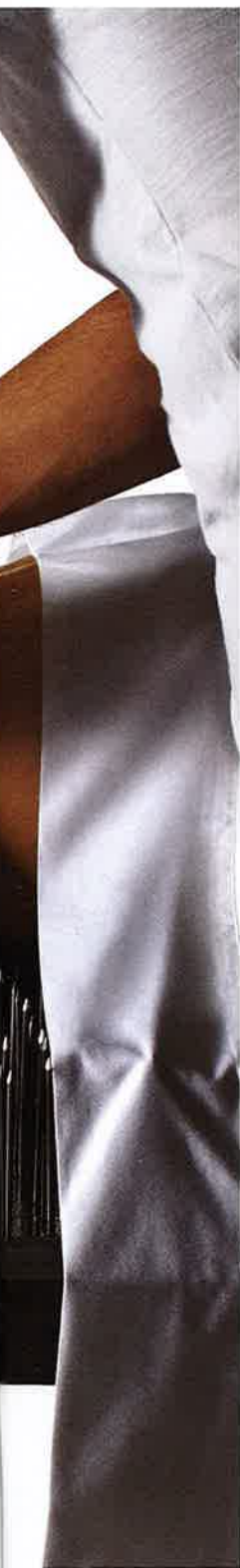
PROP STYLING BY ROBIN FINLAY.