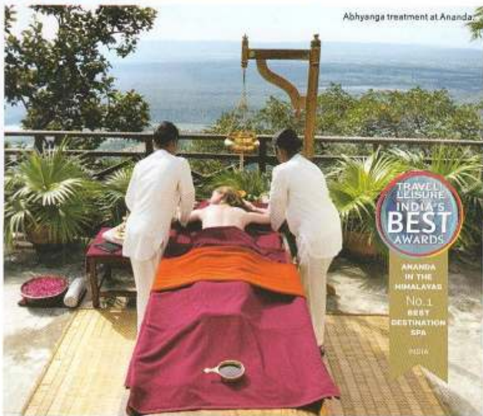
Ahyanga treatment at Ananda.