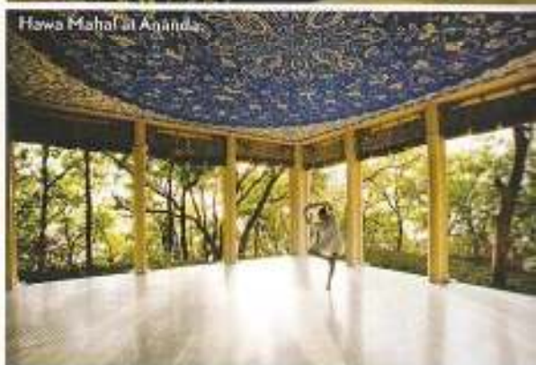
Hawa Mahal at Ananda.