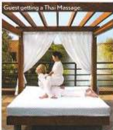
Guest getting a Thai Massage.